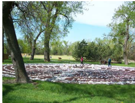
An outdoor labyrinth is available for a unique prayer experience.

This special day is just for you ... use it as you wish. Upon arrival to our Center you will be warmly greeted as we show you to a comfortable private room. We will offer a brief overview of the Center, chapel, library, dining area and grounds, and then simply let you be. Bring your lunch and/or choose light snacks from our sustenance basket (fruit, cereal bars, etc.) Whether you spend your time inside or enjoying the beautiful woodlands, you will find a sacred place for silence, prayer and quiet reflection.